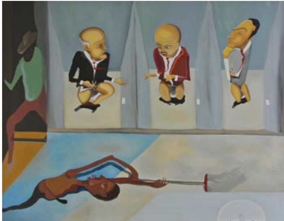
Conversations about history; 2015 Mario Zarza Zárraga Oil on Canvas 120 x 140 cm Private Collection