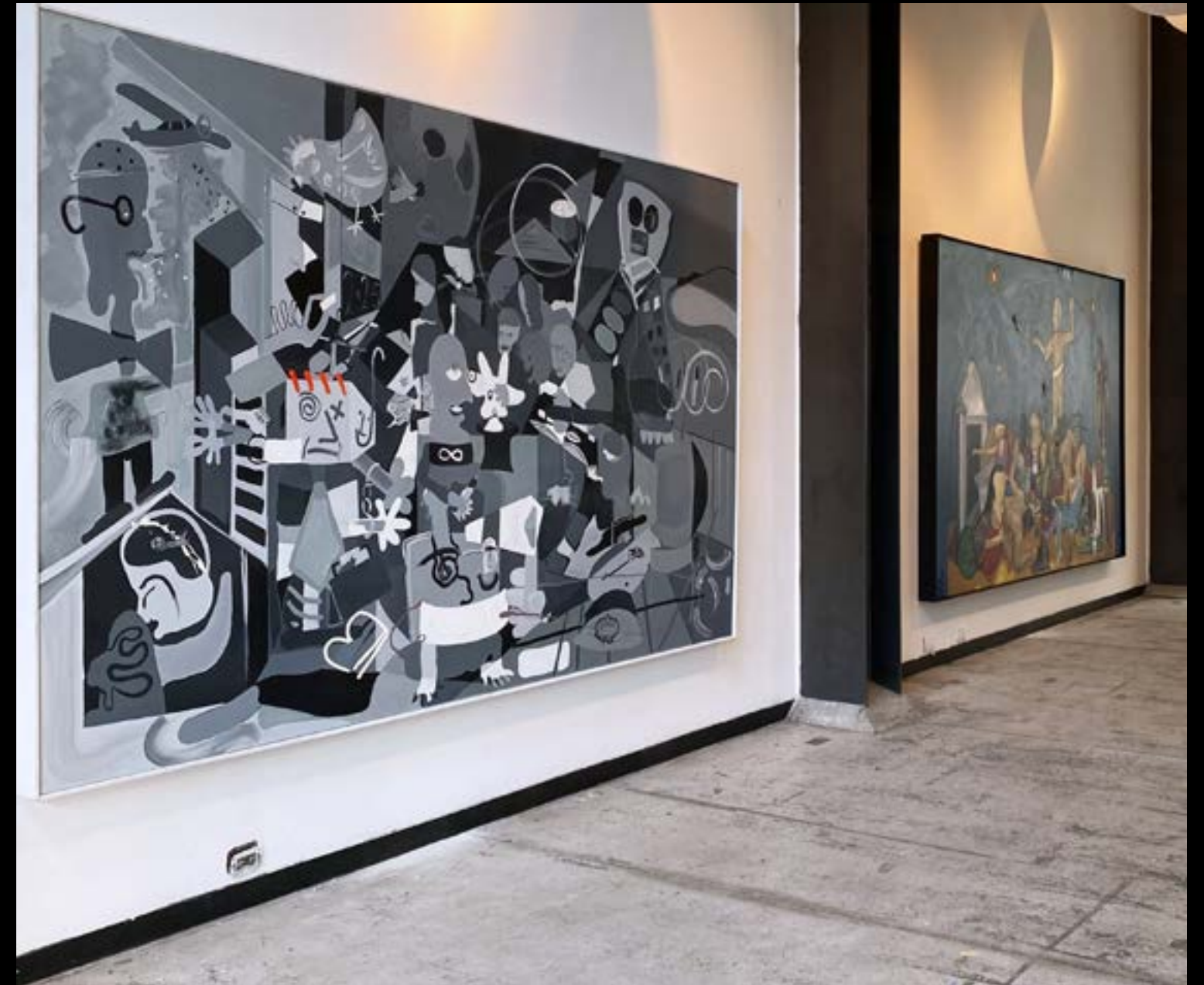
"2020", 2020 Mario Zarza Zárraga Oil on Canvas 190 x 300 cm Private Collection