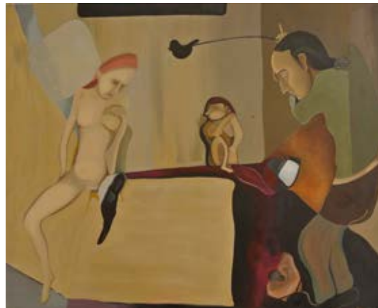
The fashion photographer; 2015 Mario Zarza Zárraga Oil on Canvas 115 x 130 cm Private Collection