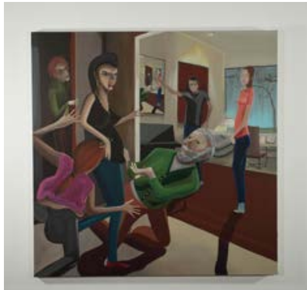
Return of the prodigal daughter; 2014 Mario Zarza Zárraga Oil on Canvas 120 x 120 cm Private Collection