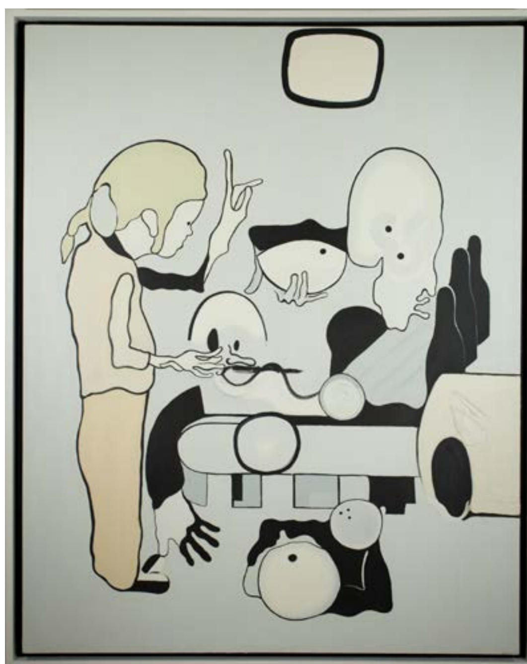
The bowling pals; 2016 Mario Zarza Zárraga Oil on Canvas 175 x 132 cm Private Collection