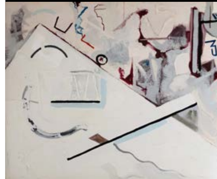
Composition #24; 2018 Mario Zarza Zárraga Oil on Canvas 90 x 120 cm Private Collection