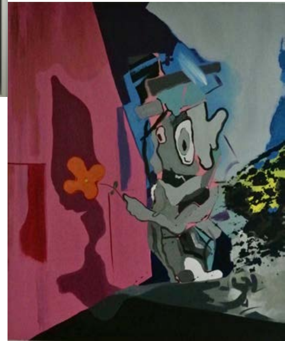
Virgilio; 2016 Mario Zarza Zárraga Oil on Canvas 160 x 140 cm Private Collection