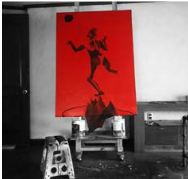
Pike!; 2014 Mario Zarza Zárraga Oil on Canvas 140 x 100 cm Private Collection