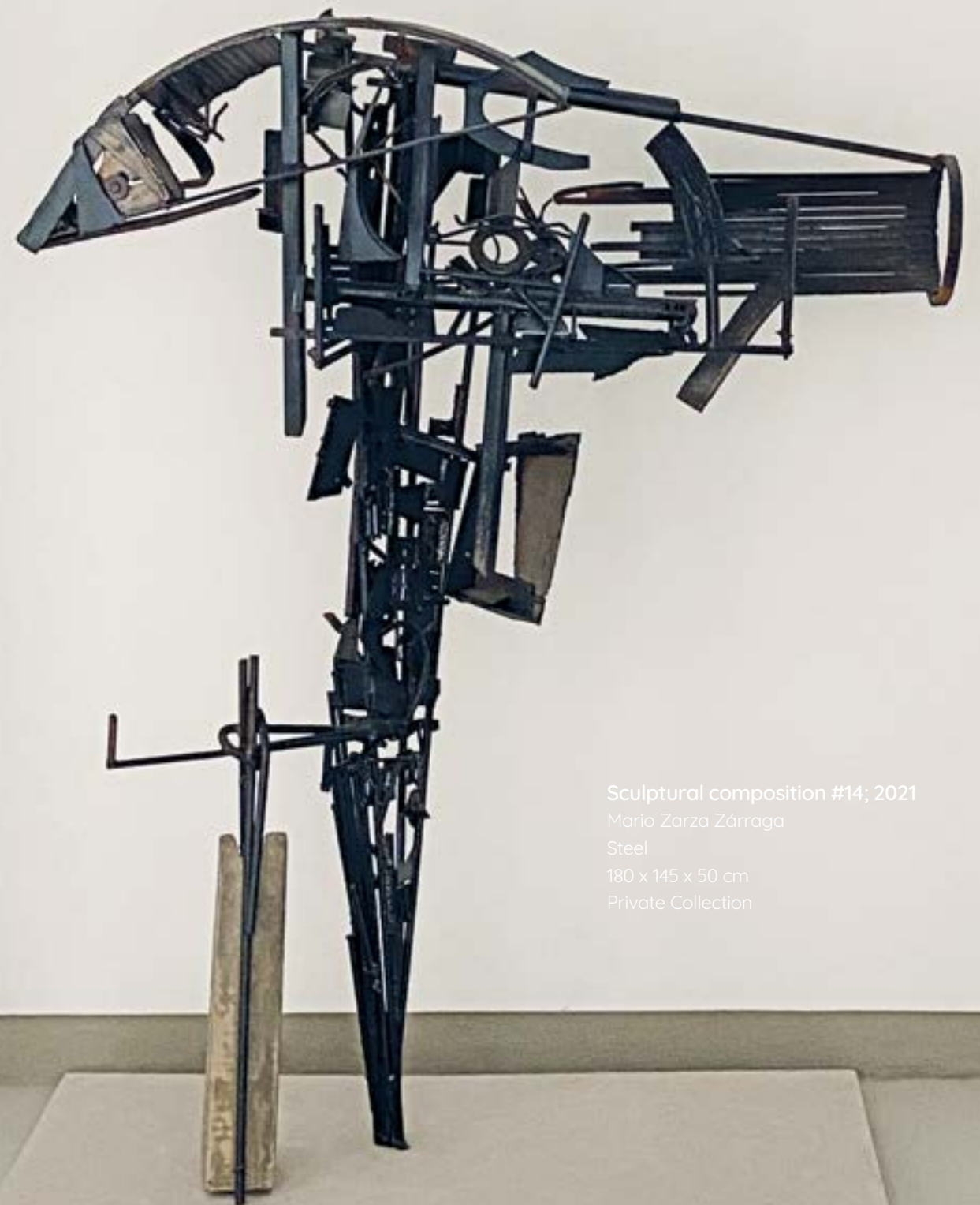
Sculptural composition #14; 2021 Mario Zarza Zárraga Steel 180 x 145 x 50 cm Private Collection