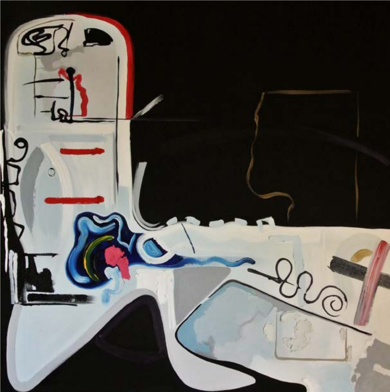
Composition # 23; 2018 Mario Zarza Zárraga Oil on Canvas 180 x 180 cm Private Collection