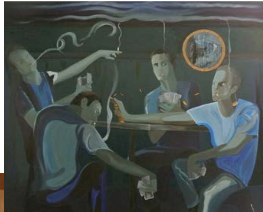
Offshore Poker; 2014 Mario Zarza Zárraga Oil on Canvas 120 x 150 cm Private Collection