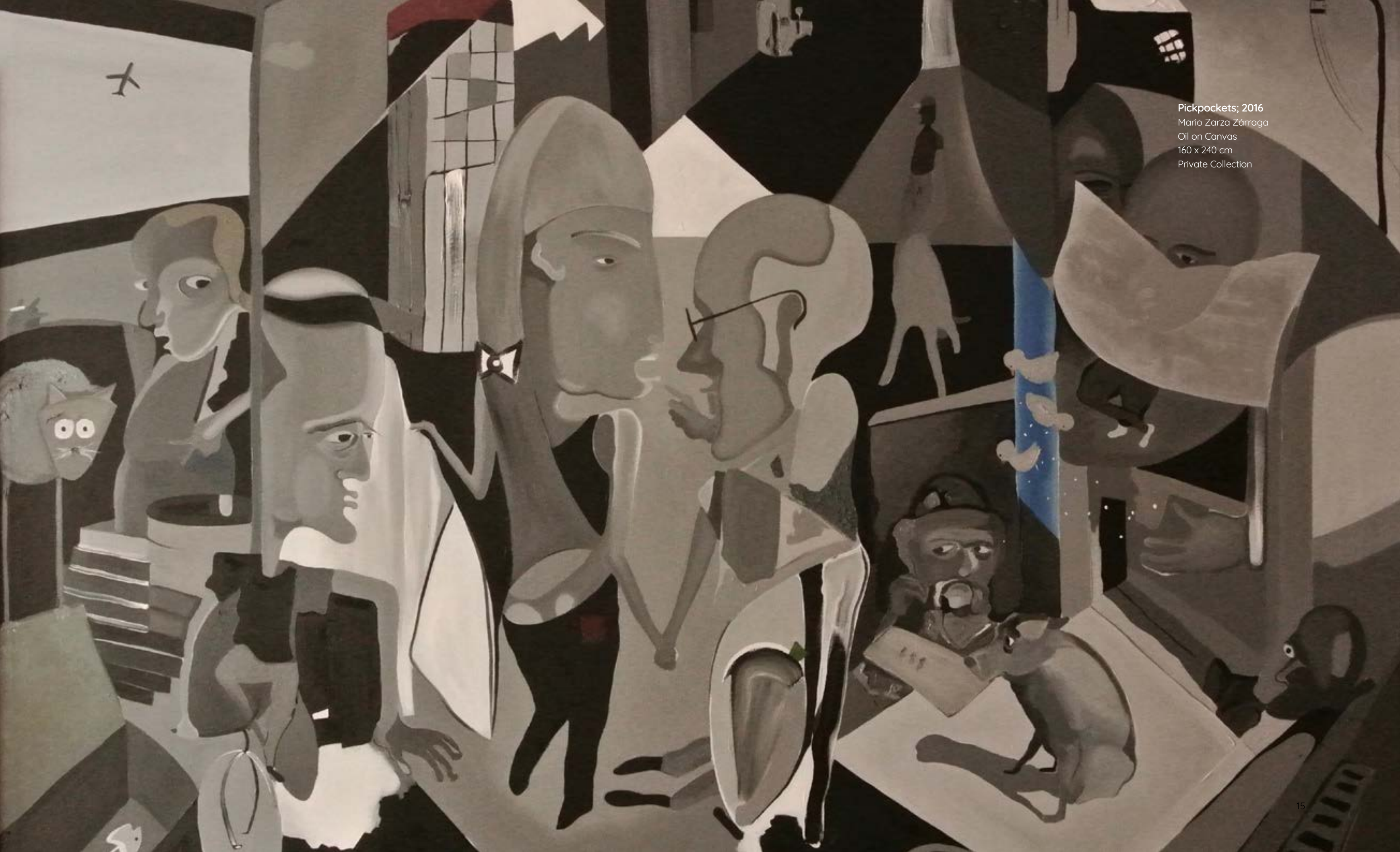
Pickpockets; 2016 Mario Zarza Zárraga Oil on Canvas 160 x 240 cm Private Collection