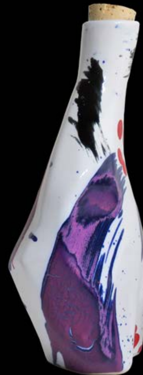
Limited edition ceramic projects Mario Zarza Zárraga Private Collection