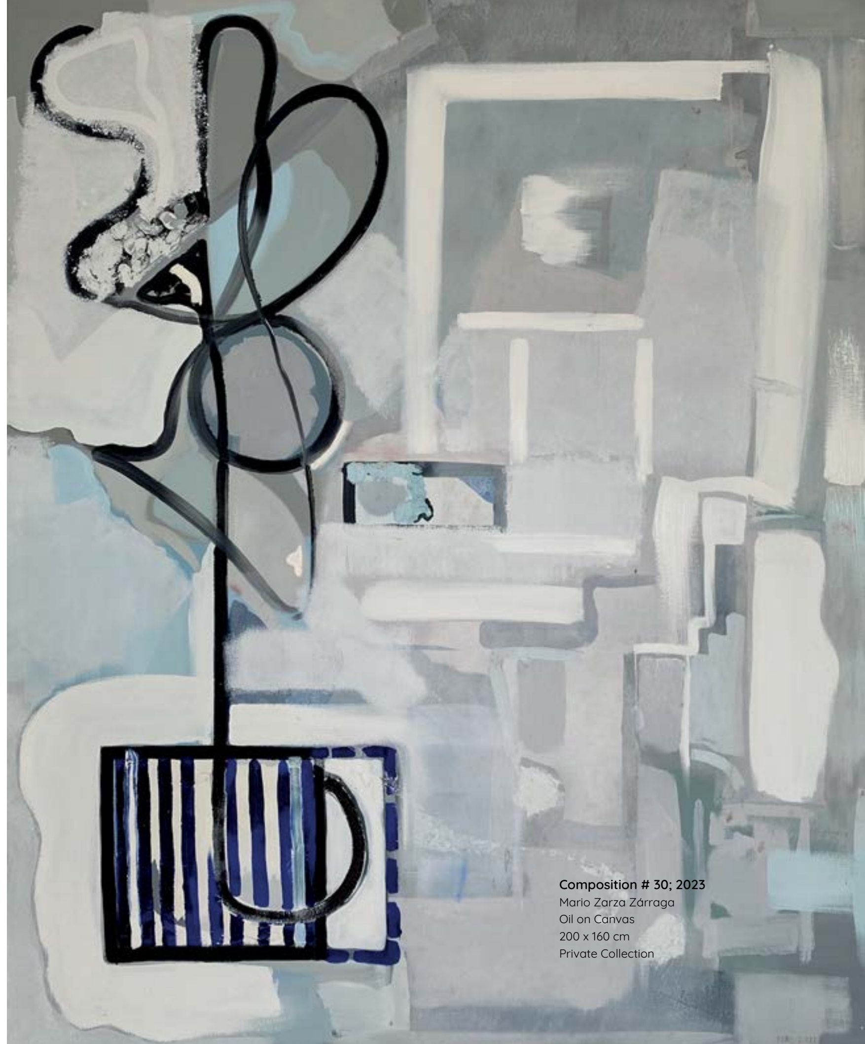
Composition # 30; 2023 Mario Zarza Zárraga Oil on Canvas 200 x 160 cm Private Collection