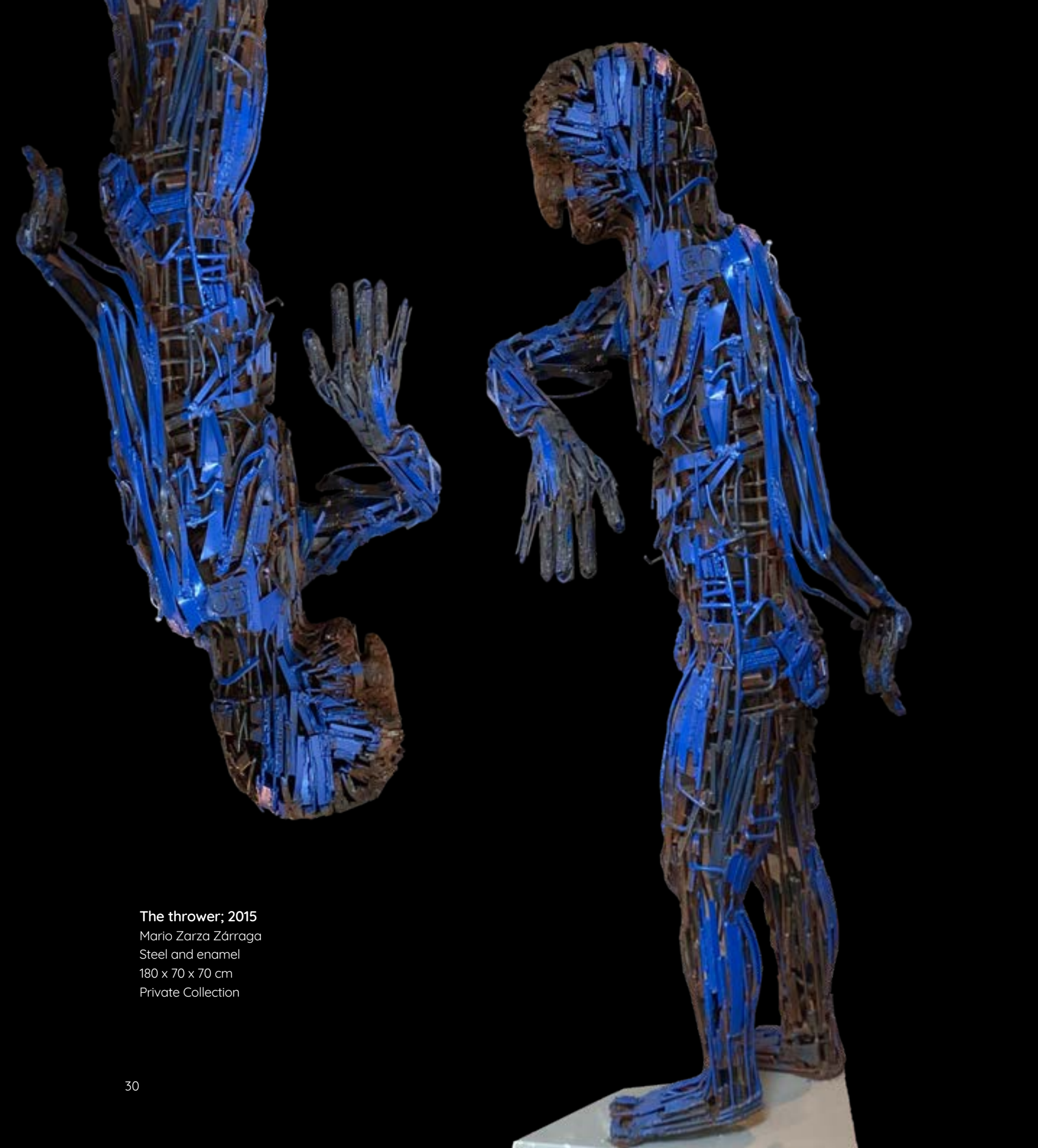
The thrower; 2015 Mario Zarza Zárraga Steel and enamel 180 x 70 x 70 cm Private Collection