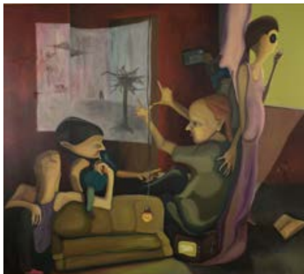
Multidisciplinary Critics; 2015 Mario Zarza Zárraga Oil on Canvas 135 x 150 cm Private Collection