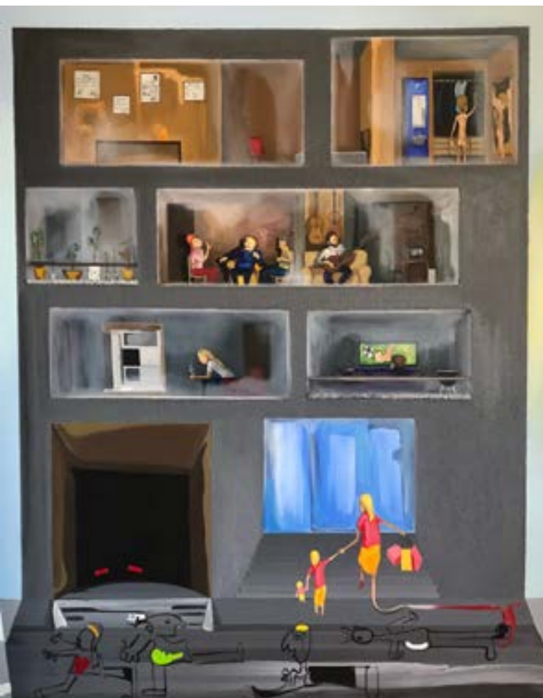
Modus Vivendi; 2018