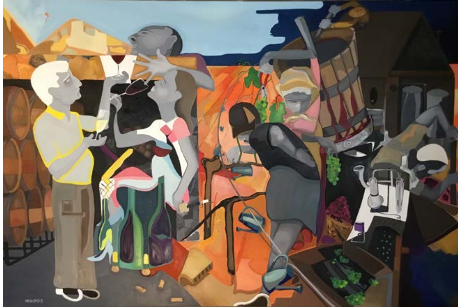
The times of wine; 2018