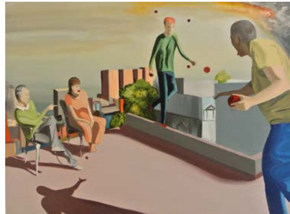
Deadly Parables; 2014 Mario Zarza Zárraga Oil on Canvas 90 x 120 cm Private Collection