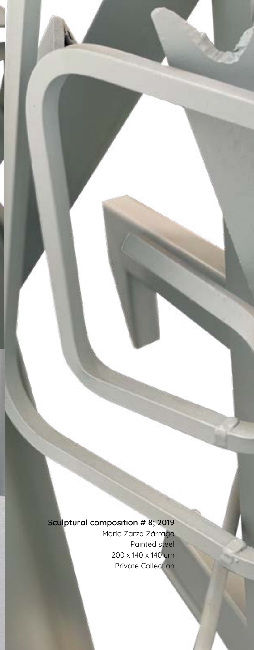
Sculptural composition # 8; 2019 Mario Zarza Zárraga Painted steel 200 x 140 x 140 cm Private Collection