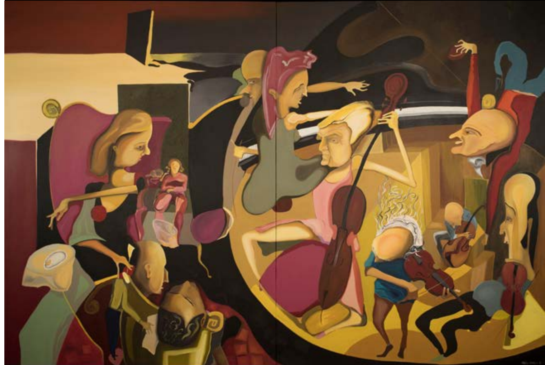
The great concert; 2015 Mario Zarza Zárraga Oil on Canvas 160 x 240 cm Private Collection