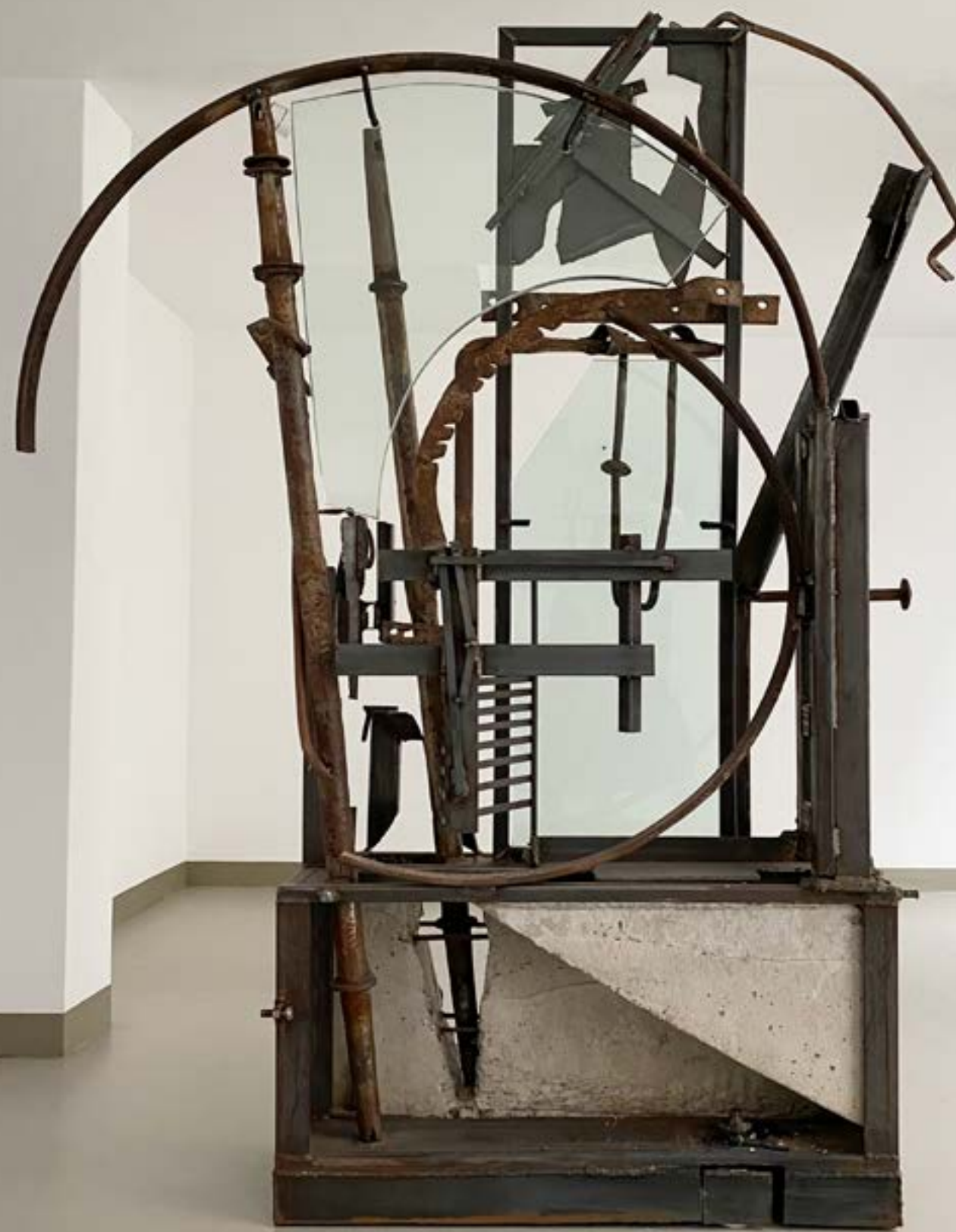
Sculptural composition # 10; 2020 Mario Zarza Zárraga Steel, concrete and glass 220 x 200 x 25 cm Private Collection