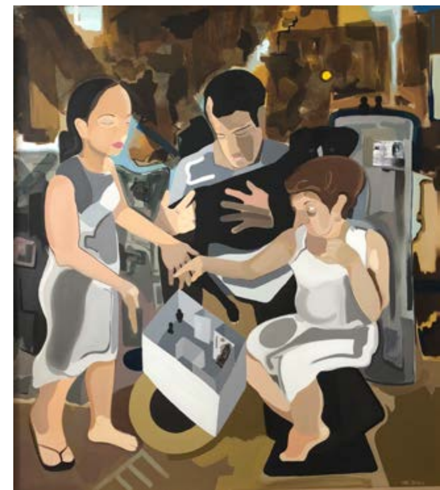
United States of America; 2018