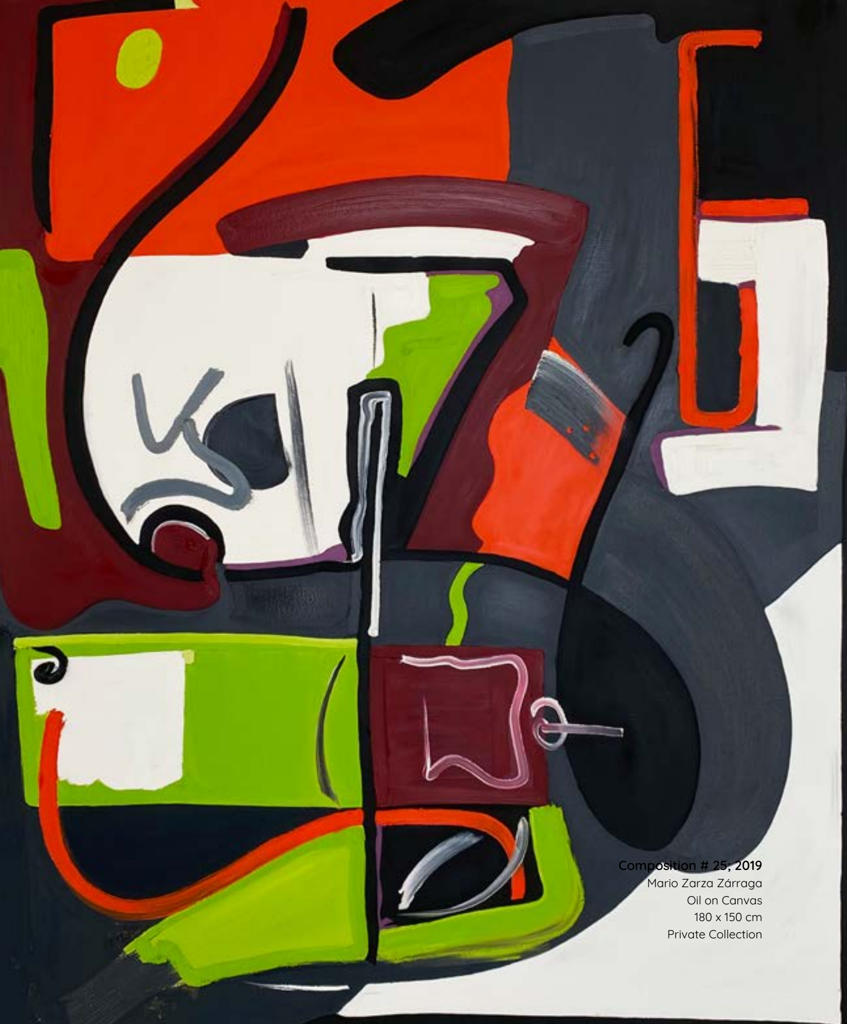
Composition # 25, 2019 Mario Zarza Zárraga Oil on Canvas 180 x 150 cm Private Collection