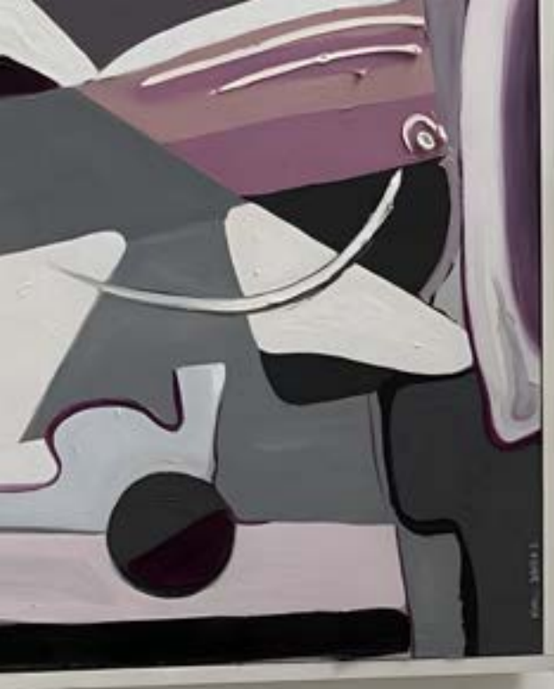
Sculptural composition #12; 2020 Mario Zarza Zárraga Painted steel 160 x 45 x 60 cm Private Collection